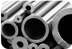
PIPES & TUBES